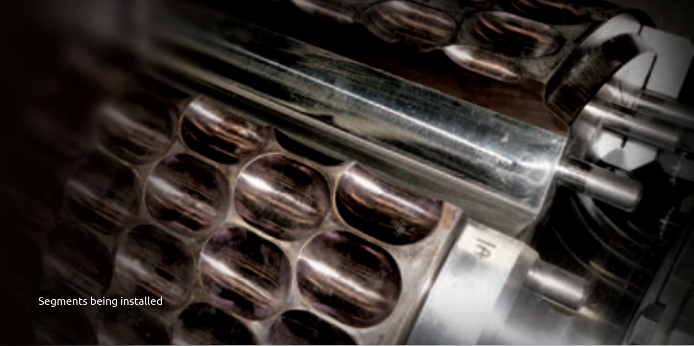
Segments being installed