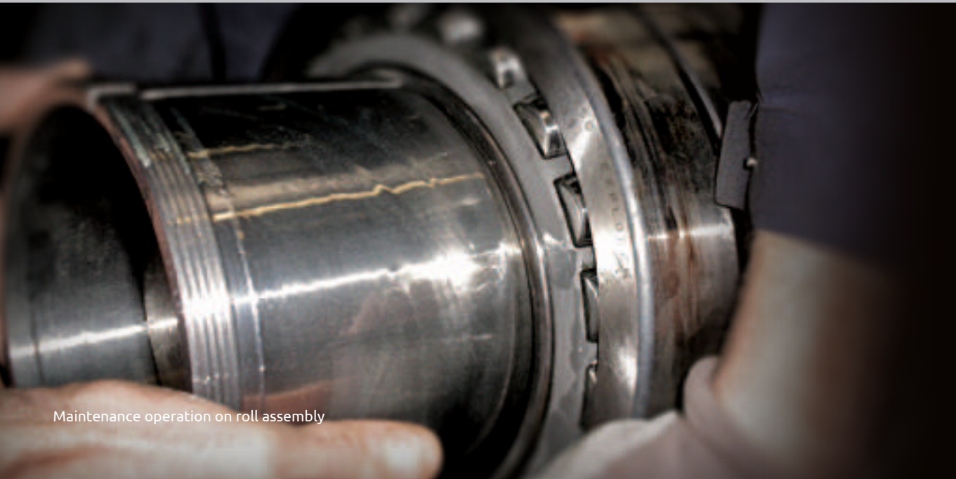
Maintenance operation on roll assembly