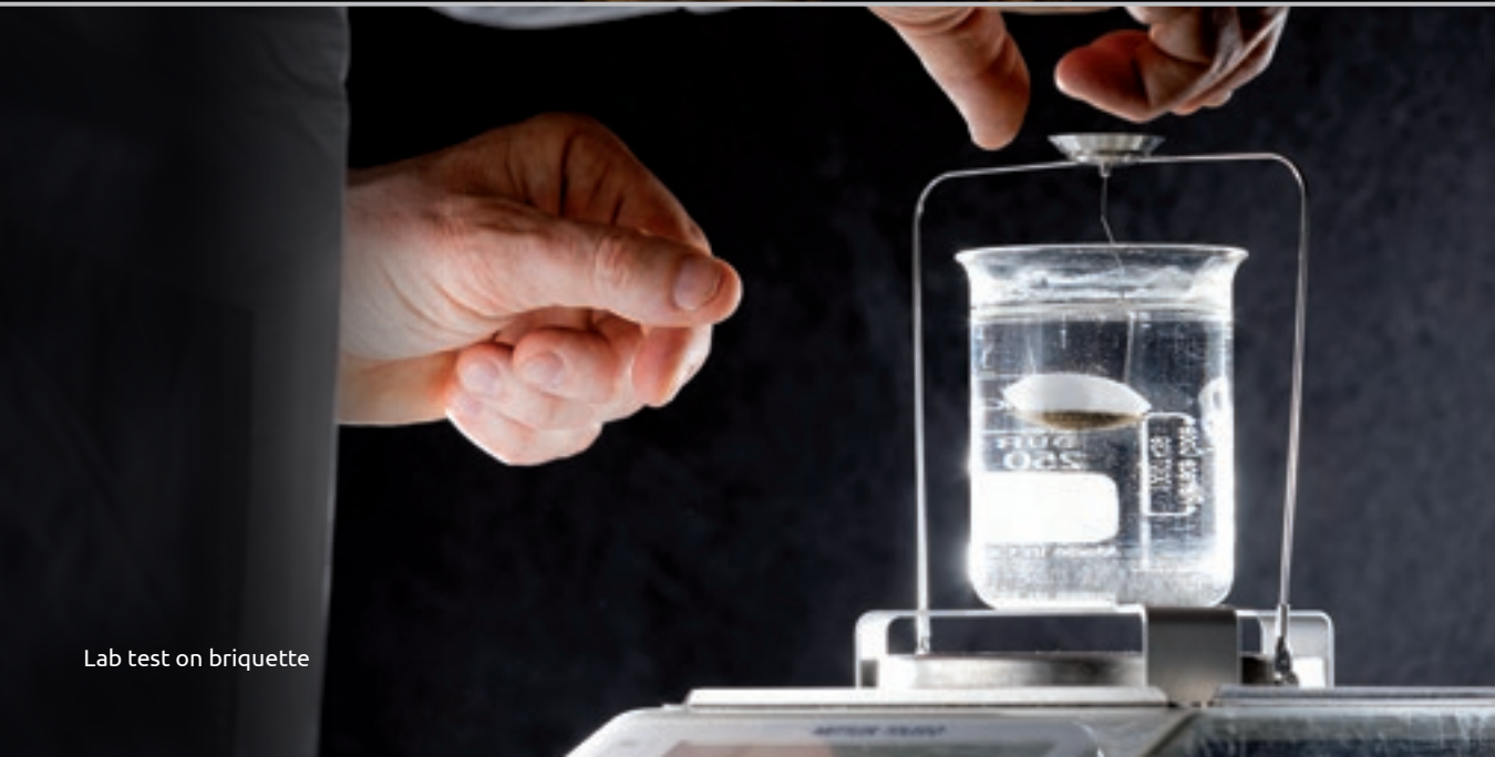
Lab test on briquette